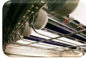
ICH Q1B Combination UV and VIS shelf lighting

Stability and durability testing of cosmetic products