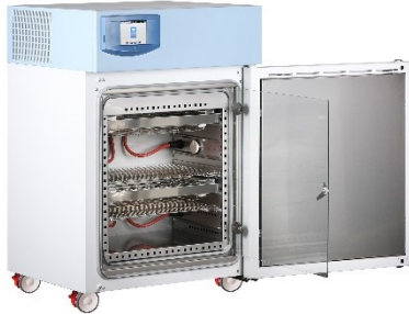
111 (4 ft3) With two ICH Q1B light shelves

Back (L – R) 404, 707, 1212 Front (L – R) 55*, 111, 222