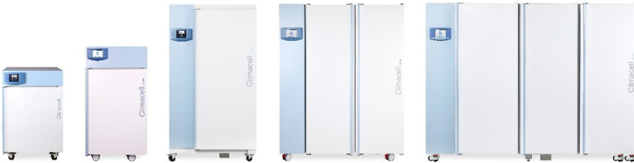
L to R: 111, 222, 404, 707, 1212